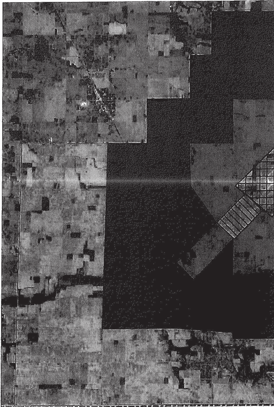
Cross Area: combination Clear Zone; Diagonal Area: APZI; Blue Area: combination APZII; Purple: Inner Conical Area; Pink: Outer Conical Area